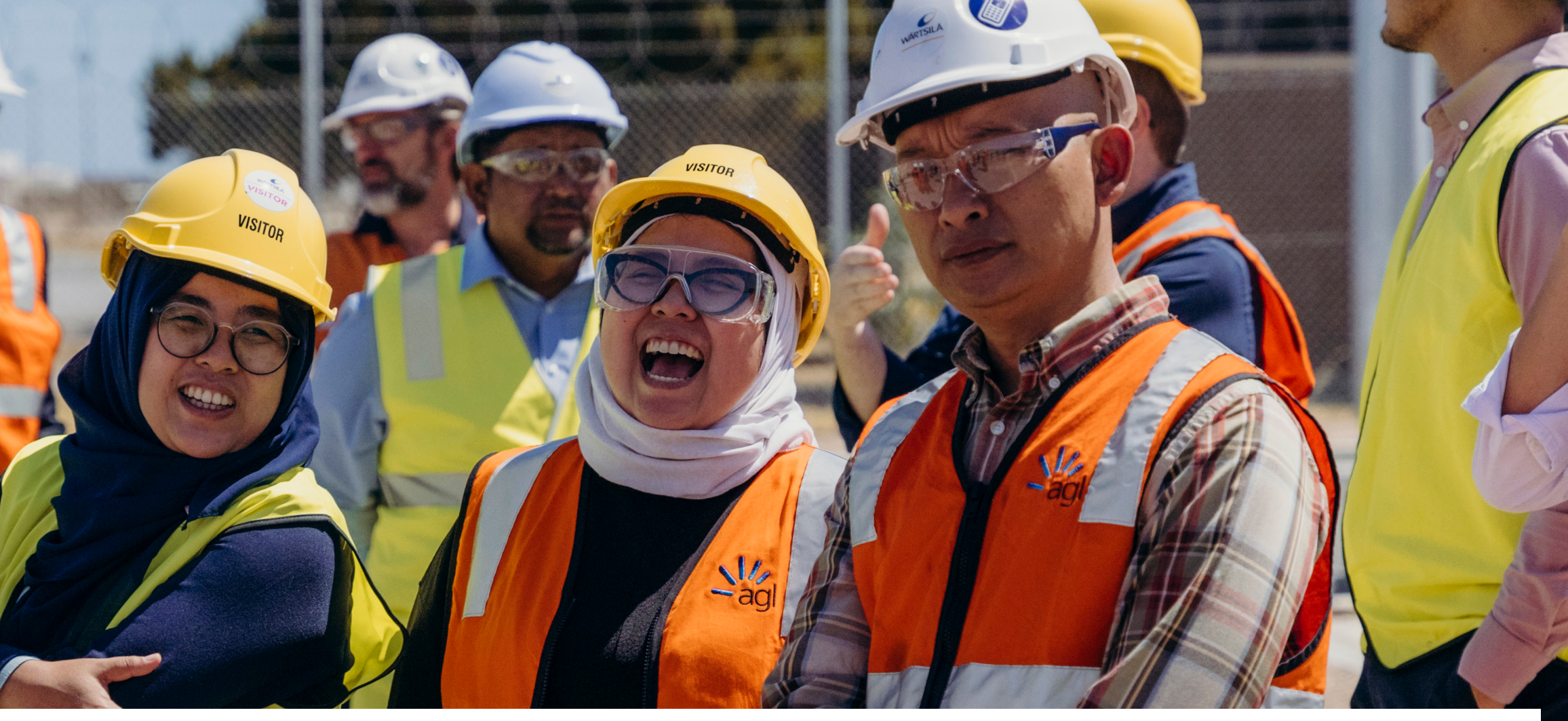
Image: P4I supports partner governments to integrate clean energy technologies.

P4I and CSIRO are supporting the Electricity Generating Authority of Thailand (EGAT), the country's largest electricity generation and storage provider, to explore different energy storage options. As a direct result, EGAT has expanded its energy storage team and subsequently increased investment in battery energy storage systems at its Sirindhorn Dam floating solar farm, part of a A$4.2 billon investment to supply clean power to the country. EGAT and CSIRO have now signed an memorandum of understanding to cooperate on energy storage technologies, batteries and clean hydrogen and are working on development of additional battery projects across Thailand.