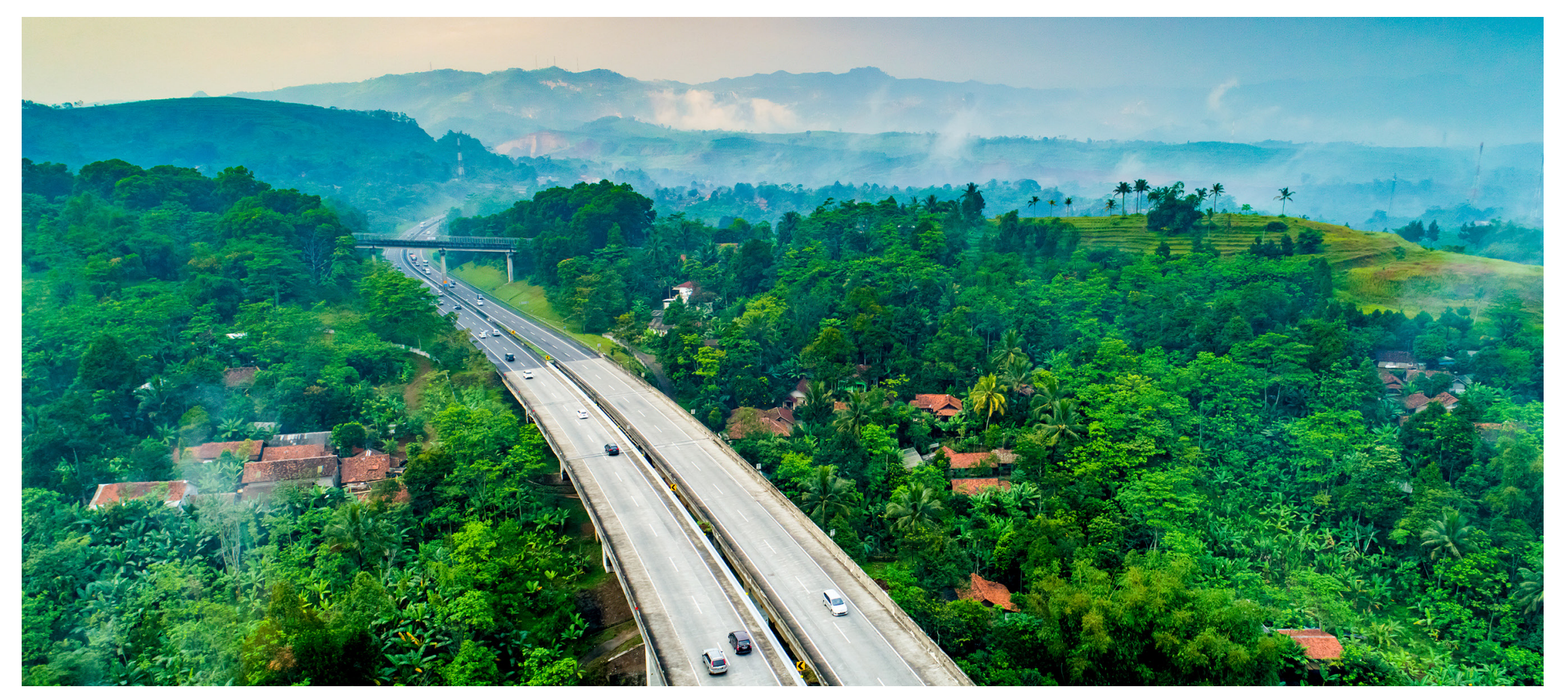
Image: Cikubang Bridge, part of the Cipularang Toll Road in West Java, Indonesia.

The resilience of land transport networks is fast becoming a major area of demand for P4I, given Australia's experience managing the economic and social impact of increasingly severe weather events. P4I is expanding its network of Australian partners to help respond to this demand.