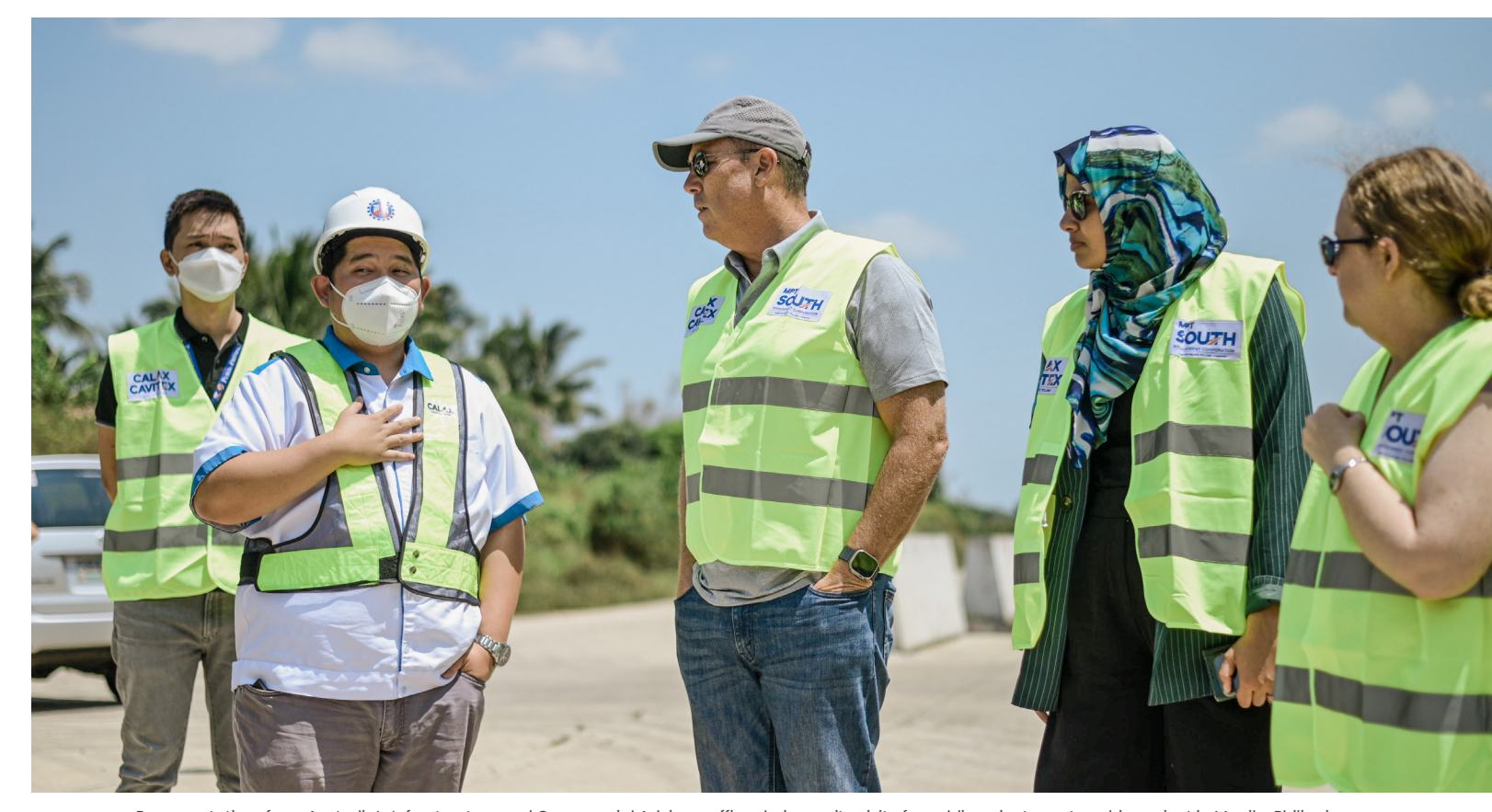
Representatives from Australia's Infrastructure and Commercial Advisory office during a site visit of a public-private partnership project in Manila, Philippines.

Australia is recognised for delivering high-quality infrastructure using innovative financing models. Drawing on this experience, P4I has responded to high demand for support to strengthen infrastructure planning, prioritisation and procurement, and to improve access to more diverse and better-quality infrastructure finance.