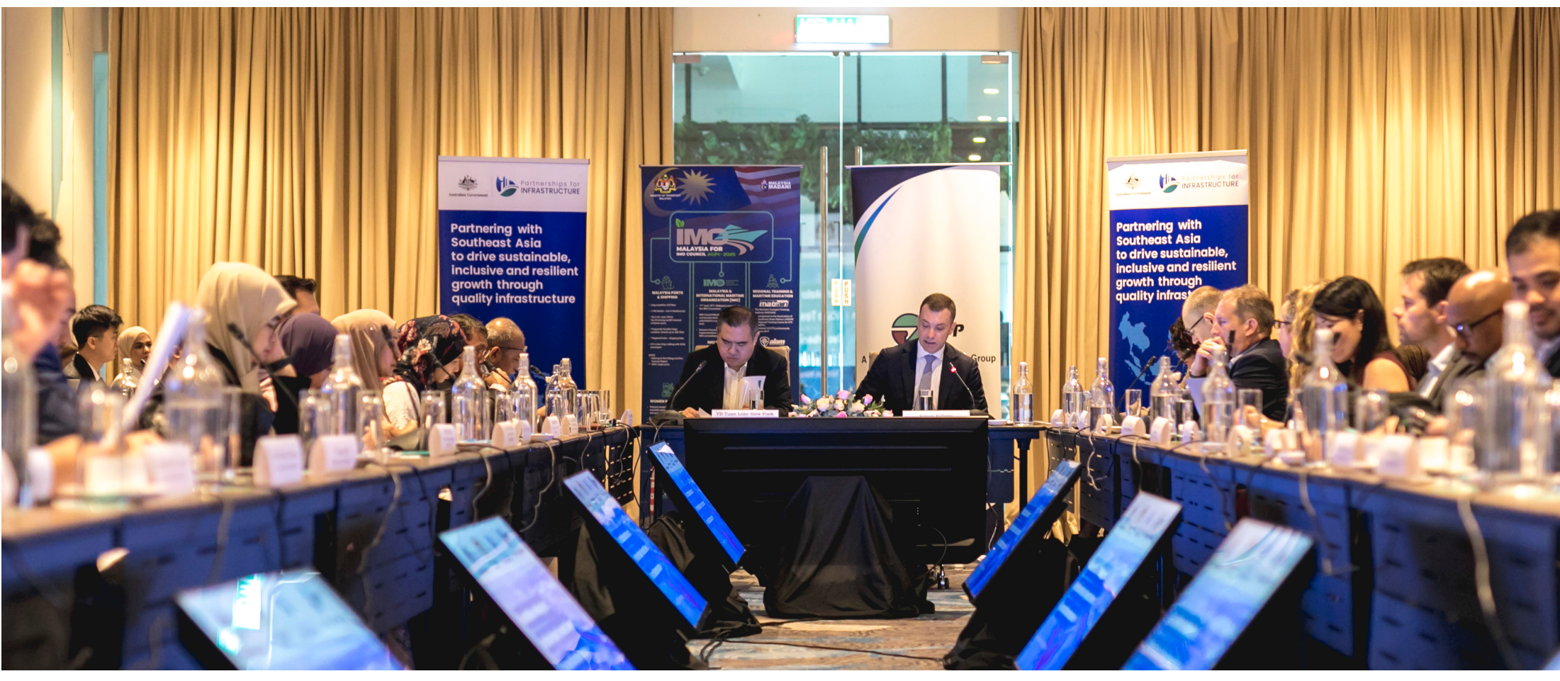
Image: P4I brings together Australian and Southeast Asian government counterparts to partner on quality infrastructure development.

P4I is delivered through a partnership between the Department of Foreign Affairs and Trade, EY, Adam Smith International, The Asia Foundation and Ninti One.